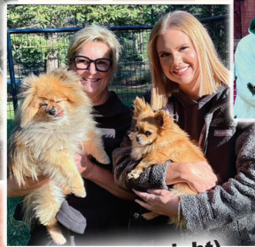
Foxy (on right)