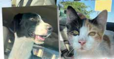
Norma & Pearl Found Together!